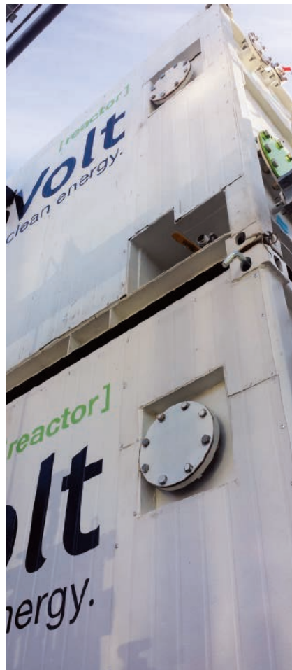
Cambrian Innovation's EcoVolt Reactor harnesses bacteria that produce electrical current and biogas as byproducts of digesting organic matter contained in winery wastewater.